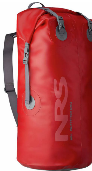
Large Dry Bag